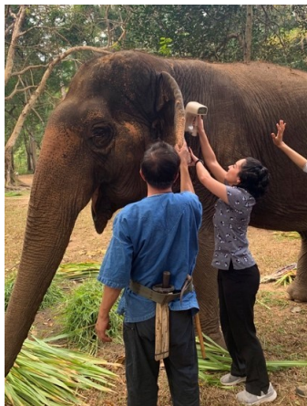
Figure 1: "A Mahout assists by pulling back the elephant's ear while I scan for a microchip."

"Traveling abroad is stressful, especially if it is your first time, and money plays a big role in that stress. Having received the scholarship relieved a bit of that stress for me as I was provided the funds to secure better travel accommodations in terms of airfare and lodging and have the peace of mind that is so elusive while planning a trip abroad. The scholarship enabled me to focus more on planning my trip and less on worrying about my comfort and safety. I would encourage others to apply for the travel scholarship simply because trips abroad are not cheap. I would say our flight to Thailand was by far my biggest expense. For me, the scholarship was able to cover at least half of the flight. Any type of funds received I would say would be a big help. It would also allow for more of your focus to go towards planning a trip in contrast to trying to find money to fund the trip."