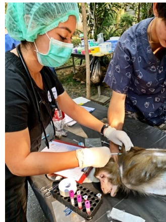
Figure 2: "The veterinary assistant is restraining a sedated macaque as I administer medication subcutaneously."